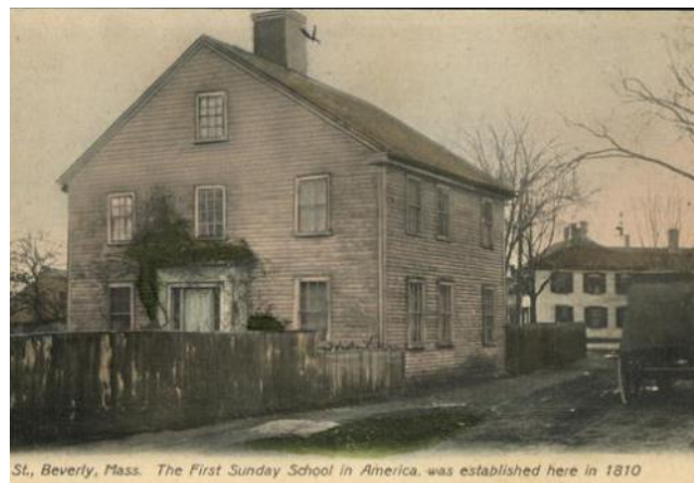
Beverly, Mass. The first Sunday School in America, est. in 1810

Sunday school started in England in the 1780s and truly was school. Due to the Industrial Revolution, poor children were working six days a week in factories and were illiterate. Visionary evangelicals like Robert Raikes devised a plan to gather poor, uneducated working children into education classes on Sundays, the children's only day off. Clean clothes and learning materials were provided, and instruction given in reading, writing, hygiene and good citizenship. The churches hoped that this effort would serve the dual purpose of bettering the future of society and curbing the rampant delinquency. Sunday schools started to teach the three Rs (reading, writing, and arithmetic) using the Bible. Though neither evangelism nor religious training were the expressed goals of the new schools, there was the hope that the morality taught, being based on the truths of Scripture, might bring about a transformation in the hearts of the children. Basic catechism, morality, prayers, and hymn singing were taught as well. And so the Sabbath or Sunday school was born.